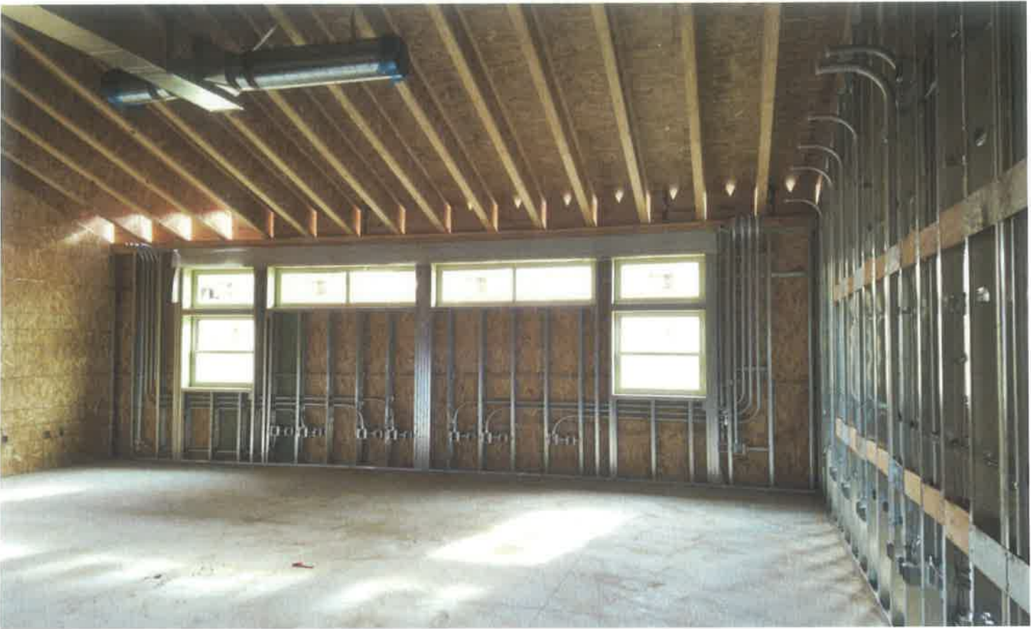
Classroom Window Wall (Above) & Classroom Rough-In Work (Below)