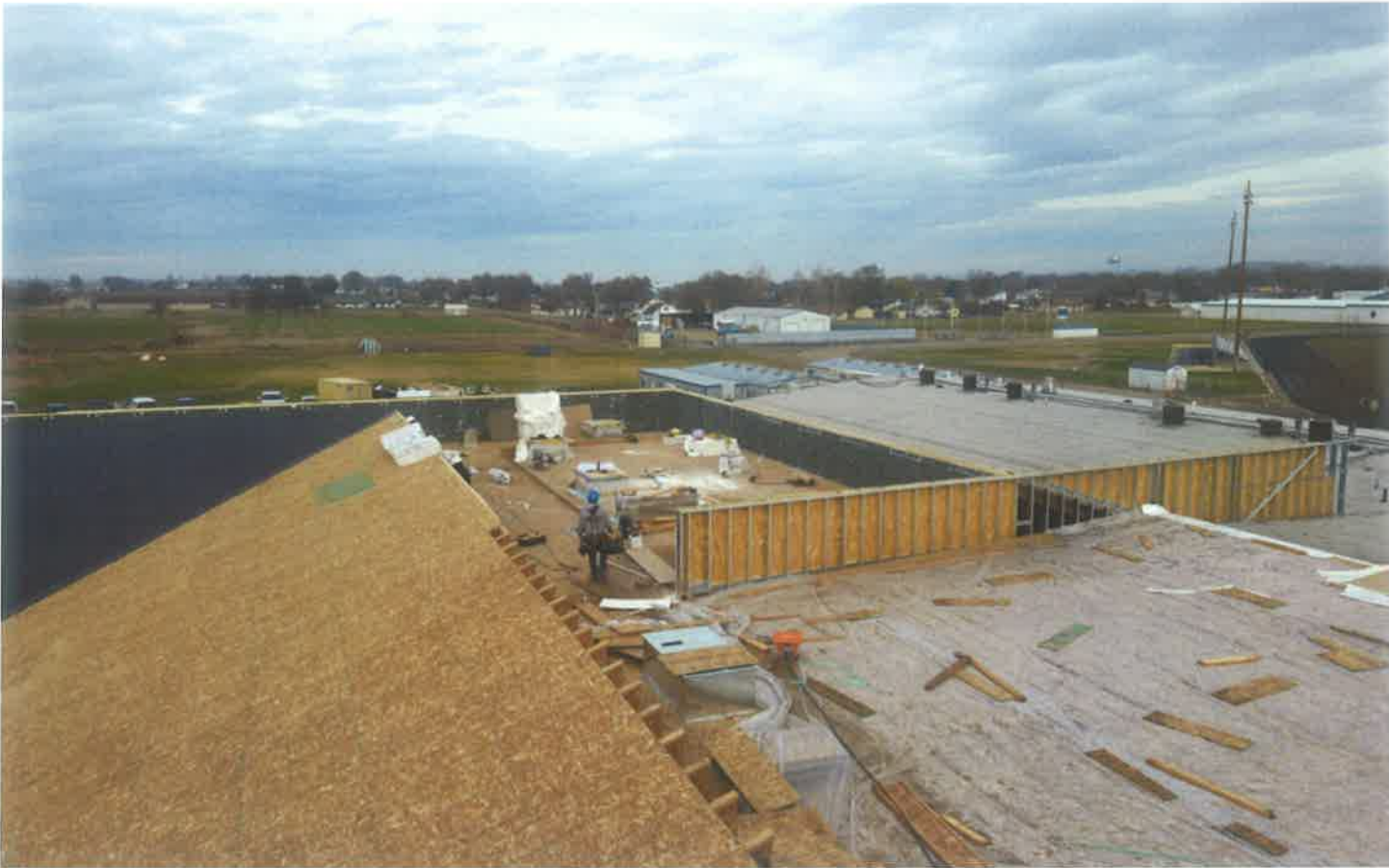
Roof Structure / Commons Overbuild (Above) & South Mechanical Well (Below)