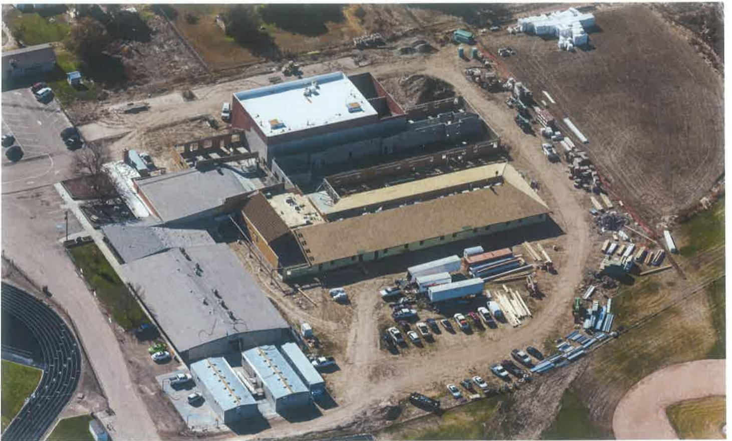
Building from Northeast – 10/26/17 (Above) & from the Southwest (Below)