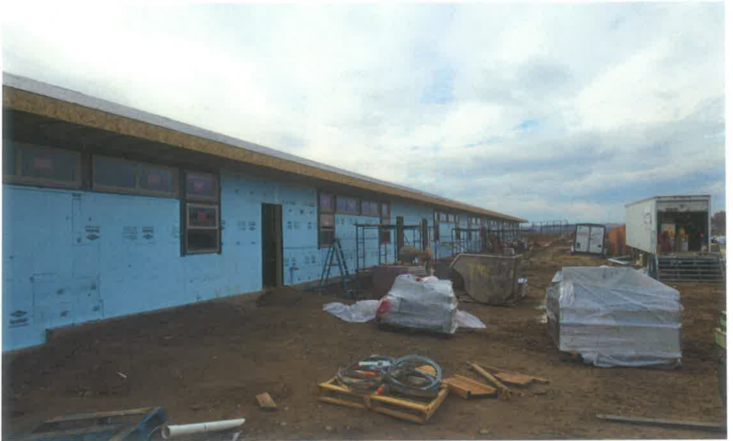
North Elevation Set-Up for Veneer (Above) & East Overhang (Below)